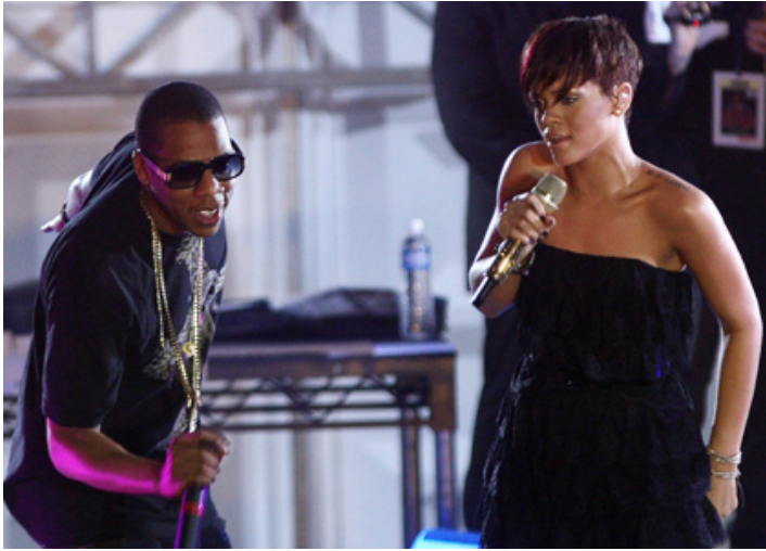
Jay-Z and Rihanna perform their hit, "Umbrella"

One concert, jam packed with the best of the music world—set the scene for a great time while celebrating a great country. Jay-Z , Mary J.Blige , Usher , Rihanna , and Chris Brown rocked the 3rd Annual THISDAY Fashion and Musical Festival, which took place in Abuja, Nigeria on Friday.